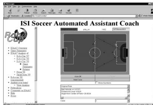
Figure 2: ISAAC’s multimedia viewer

Utilizing the models involves using a different presentation technique at each granularity of analysis to maximize human understandability. For the individual agent key event model, the rules and the cases they govern are displayed to the user. By themselves, the features that compose a rule provide implicit advice for improving the team. To enable the user to further understand the situation and validate the rules, a multimedia viewer is used to show cases matching the rule (See figure 2). A perturbation analysis is then performed to recommend changes to the team by changing the rule condition by condition and mining cases of success and failure for this perturbed rule. The cases of this analysis are also displayed in the multimedia viewer.