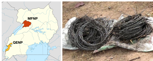
Figure 1: (Left) Map of Uganda, with locations of MFNP and QENP shown. (Right) Dozens of snares confiscated by rangers.

Artificial intelligence (AI) has been leveraged to prevent poaching, focusing on learning poacher behavior to plan ranger patrols [Gholami et al. , 2018]. During these patrols, rangers directly protect wildlife by confiscating snares that would otherwise sit out and trap endangered animals. An indirect impact of patrols to protect wildlife is through deterrence , reducing the frequency at which poachers attack in the future. Past work has investigated deterrence to inconclusive results [Ford, 2017; Dancer, 2019]. Previous models typically accounted for deterrence simply by including past patrol effort as a feature in machine learning models, without