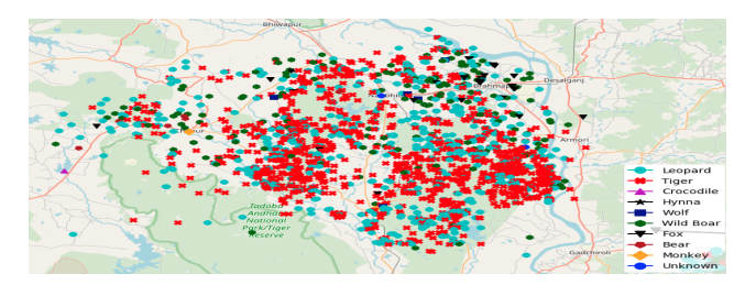
Figure 1: GPS plot of human-animal conflicts in the Bramhapuri Forest Division, India from 2014 to 2017

set, our methods provide a prediction accuracy of 80.4% for a spatial granularity of 4 km \times 4 km. In addition to the results on a real data set, we are also in the process of deploying interventions on the ground based on our predictions (details in Section 6).