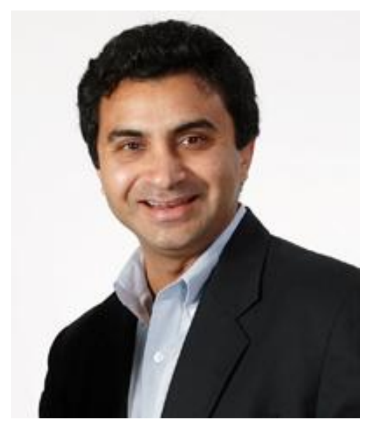
Milind Tambe's ARMOR-PROTECT software system makes U.S. ports safer

Armed with that information, the operative and two associates board a small boat early one Saturday morning and make their way to the ferry terminal. They time their arrival to coincide with the departure of a particularly crowded ferry to Catalina Island. Pulling up alongside the boat, the terrorists detonate an improvised explosive device, or IED. Chaos and pandemonium ensue.