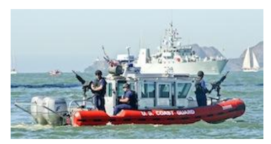
A Coast Guard boat on patrol