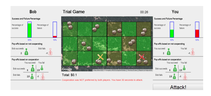
Figure 1: Hunters vs Rangers game interface

decisions about: i)whether they are inclined to cooperate with the other player or not and ii) which region of the park to put their snare (trap) where there is less chance of getting caught and also a high chance of capturing a hippopotamus. So the human subjects may decide to attack "individually and independently" or attack "cooperatively" with the other player. In both situations, they will attack different sections separately but if both of them agree to attack cooperatively, they will share all of their pay-offs with each other, equally (fifty-fifty). To enhance understanding of the game, participants were asked to play one trial game to become familiar with the game interface and procedures. Then we provided a validation game to make sure that the players have read the instructions of the game and are fully aware of the rules and options of the game. Finally, the third game which is the main game is shown to the human subjects and their decisions are recorded. Then we analyze the human subject decisions to derive a more accurate model to describe the human adversary behavior in security games in presence of cooperation mechanism.