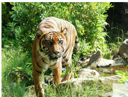
Poachers have a new enemy: artificial intelligence. Scientists have developed an AI system that can continuously learn and adapt to illegal activities and help rangers move swiftly to protect endangered animals in the wild.

Like Follow Share Tweet Reddit 0 Comments SUBSCRIBE