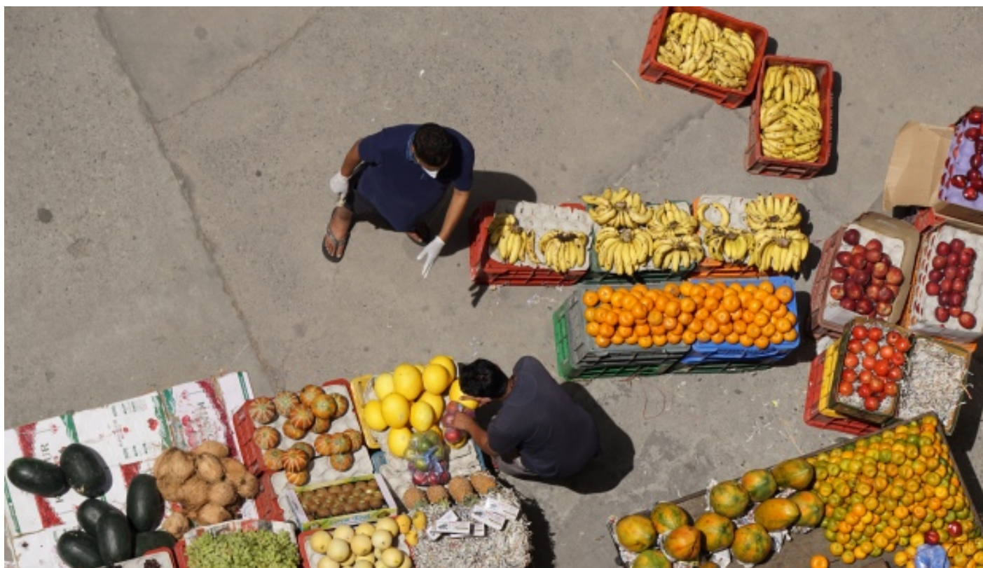
A man practices physical distancing while buying fruits from a vendor in Ghaziabad, Uttar Pradesh.